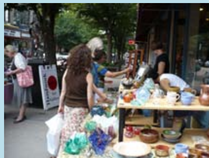
2009 Downtown Sidewalk Sale

The Downtown Ithaca Alliance is preparing to launch its new Gift Card Program. Replacing Downtown Dollars, our old paper gift certificate program, the new plastic gift cards will use a credit card based system so that all merchants who accept Mastercard can participate. The system is closed loop, meaning dollars on the cards can only be used at terminals in Downtown that are registered. The DIA hopes to increase the use of the gift card thereby keeping more dollars in our Downtown economy.