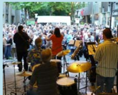
2009 Summer Concert Series