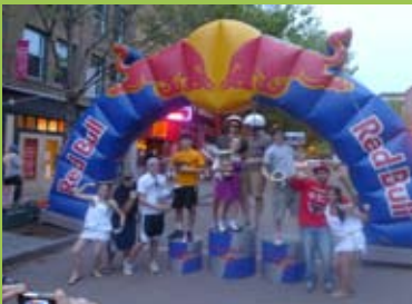
Awards Ceremony at the Red Bull Chariot Races

For successive weekends in Downtown the West End of State street came alive with Chariot Races and a Chocolate Street Fair. Saturday April 24th marked the inaugural Red Bull Chariot race in Upstate New York. Teams of College Students from throughout the Central New York region flooded into Downtown Ithaca to race home-made crafts in a competition sponsored by energy drink company Red Bull. In addition to the teams of college representatives, over 1,000 people joined in the action as fans and spectators. May 1st marked the arrival of Charlie and the Chocolate Factory at the State Theatre and in celebration of the timeless classic, "Charlie's Chocolate Street Fair" was born. Charlie's chocolate street fair featured carnival games, magic, face painting and a Willy Wonka cake complete with a flowing chocolate river.